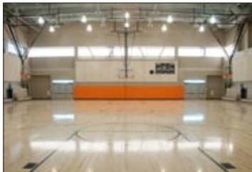
Gymnasium at East LA Area New HS #1

As part of the construction of new schools, it is the intent of the Facilities Services Division that school facilities promote the well being of the community to the greatest extent possible. As part of this goal, neighborhoods are informed of facilities activities and provided with opportunities to voice opinions and concerns in the process of developing schools.