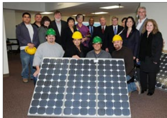
Participants in “We Build Green” Program