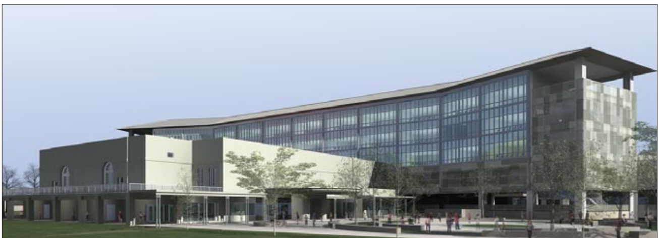
Artist rendering of Central LA New Learning Center #1 MS/HS, scheduled to open Fall 2010.

The Contractor Academy training program provides both "first time" and seasoned contractors and subcontractors a better understanding of the contract provisions and business procedures required when working with LAUSD. The Contractor Academy is designed to help contractors successfully perform and to provide guidance on how to capitalize on new District