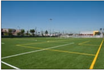
Soccer field at East LA Area New HS #1