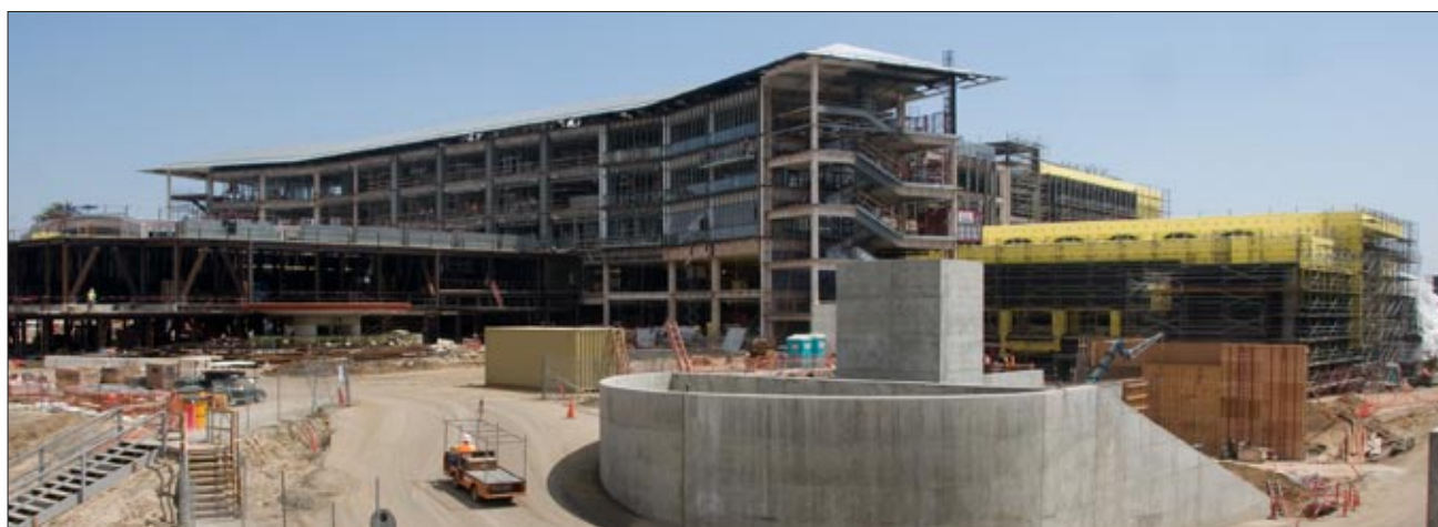
Central LA New Learning Center #1 MS/HS under construction.